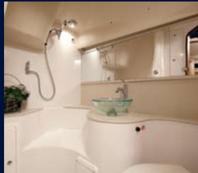
The large head is made from a single piece fiberglass molded part that creates a sculptured appearance and is easy to clean